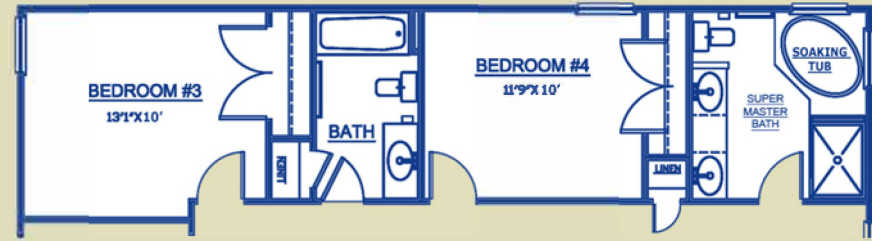
Second Floor with Optional Super Master Bath